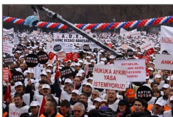
A photo taken at the "That's Enough!" Pharmacy Demonstration on December 21, 2009 in Ankara, Turkey

Turkish Pharmacists Association Records (TEB) 2008